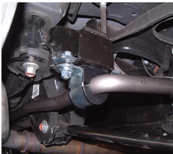
Center the bar and bracket on the mount before tightening.