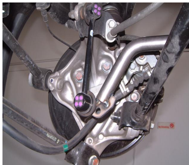
Passenger side set on the soft setting.