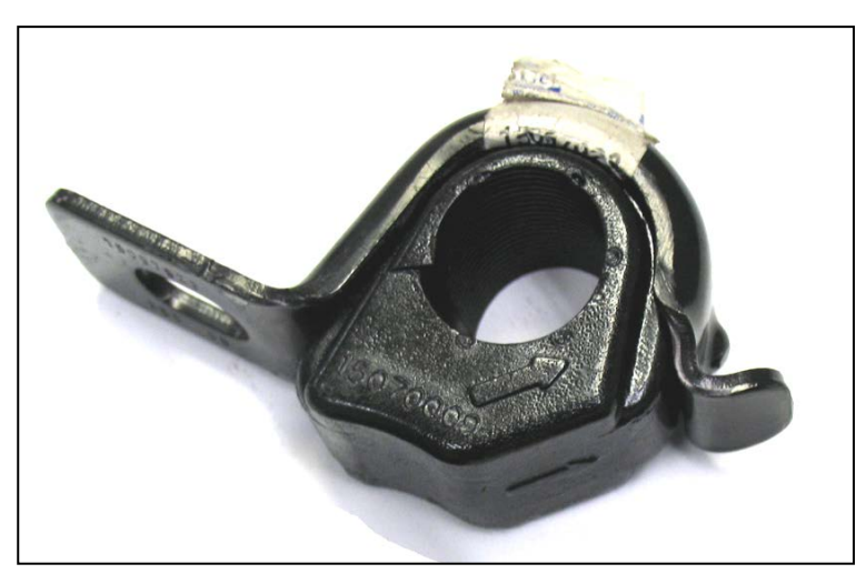
OE Style Replacement polyurethane bushing