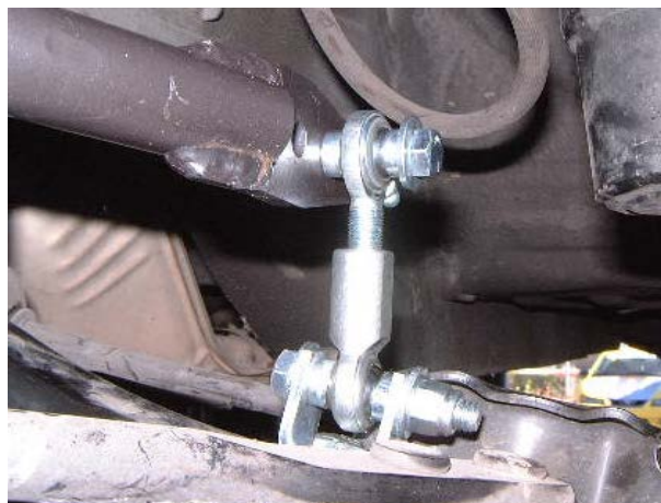
Driver side shown from the front