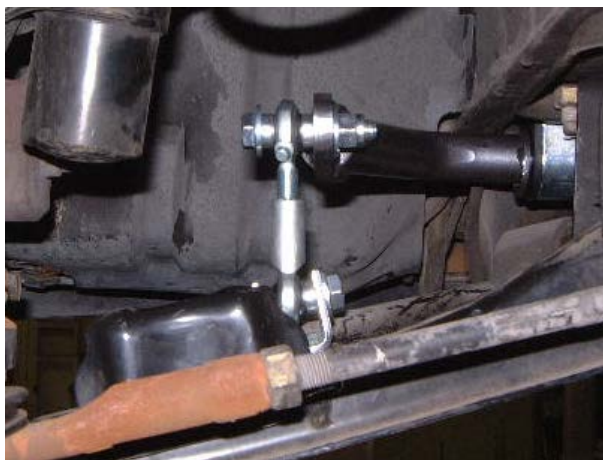
Passenger side shown from the front

5. Assemble the rod end attachment links as shown in the pictures below. Assemble the endlinks into the U-bracket supplied as shown. Make sure you place the 3/8-16 x 1.00 bolt into the U shaped bracket before attaching the endlinks. Put the U-bracket assembly into the small hole on the lower control arm. Use the supplied washers and the nylock nuts. Tighten assembly.