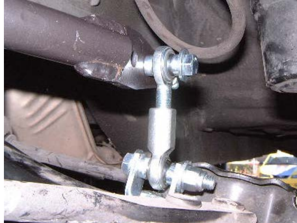
Driver side shown from the front