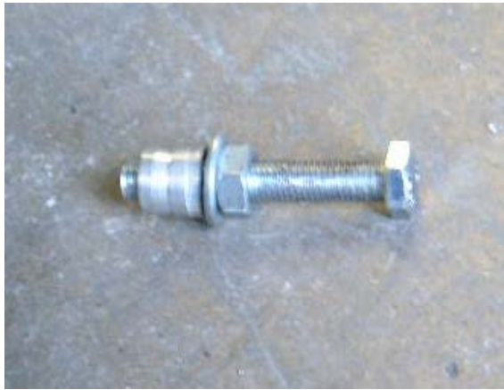
FIG 1 Nutsert shown ready to install tight