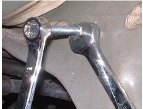
FIG 2 Hold bolt head and turn nut until