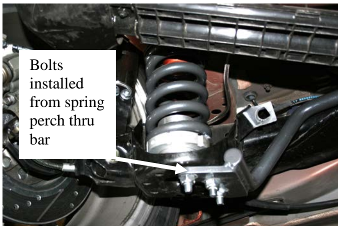
Driver Side Shown