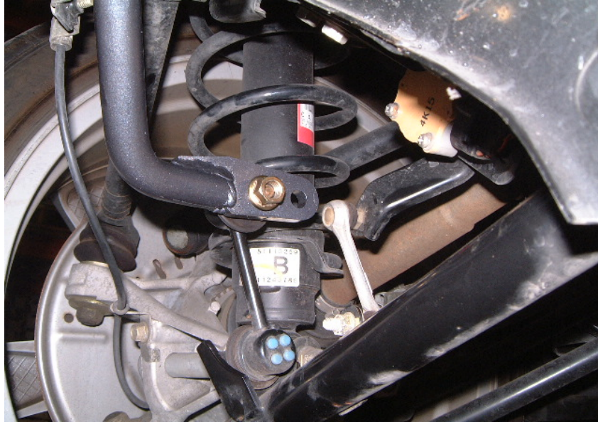
Rear bar shown in the stiff position.