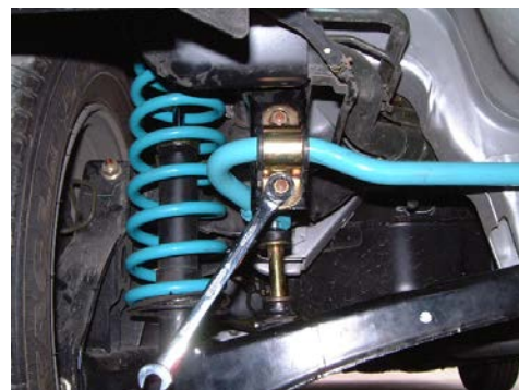
Fig. 2 Driver side view from rear