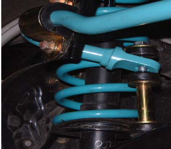
Fig. 3 End link assembly driver side