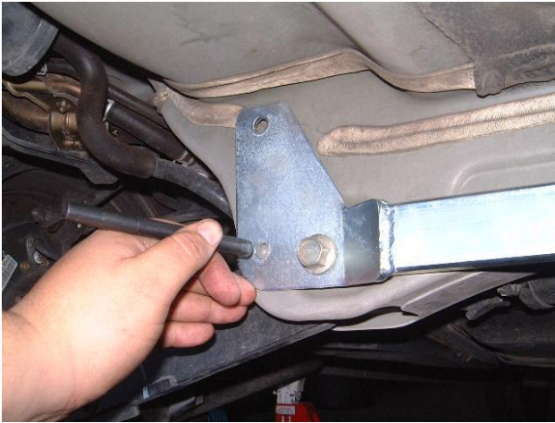
Figure 2 Driver side view from rear

3. Mark the center of all four rear brace mounting holes. Remove the brace. Drill the four holes using a 1/2" drill bit. Make sure to drill top holes as straight as possible.