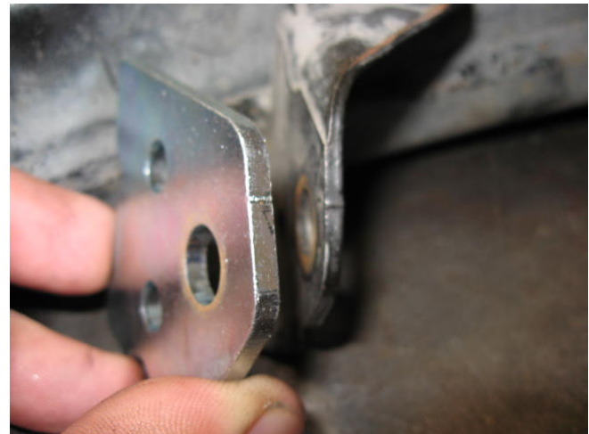
Align plate with the holes on the mounting tab.