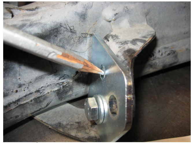
Optional 2 nd hole marked and drilled (11/32 bit)