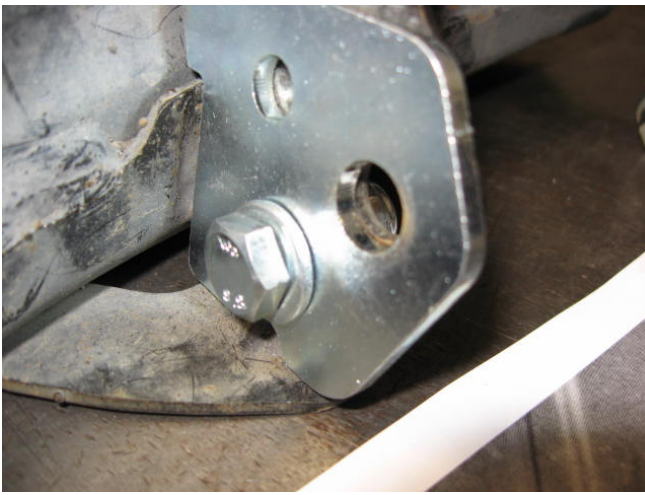
Use the M8 hardware to fasten plate 28ft/lbs