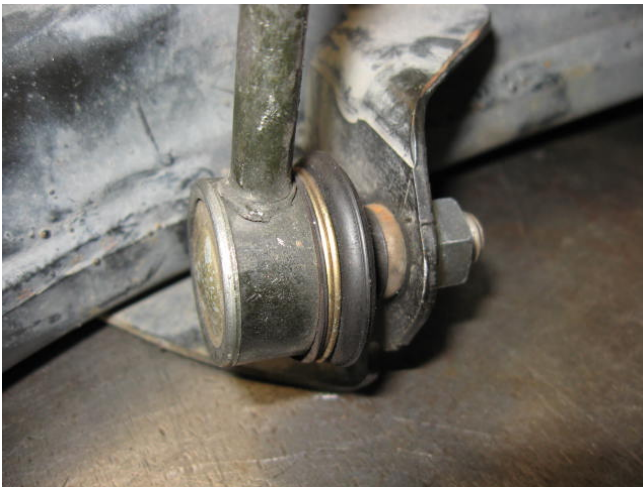
Remove OE end link from lower arm.

These plates are designed to strengthen the end link mounting point where the end link connects to the rear lower control arm.