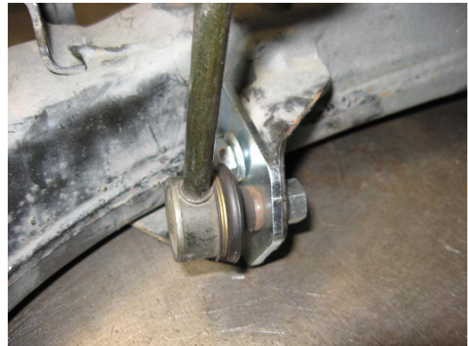
Reattach the end link, torque to factory spec 28 ft/lbs.