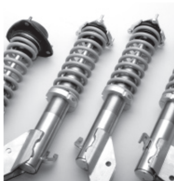
COMPETITION SERIES COIL OVERS