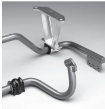
ANTI-ROLL BAR SYSTEMS