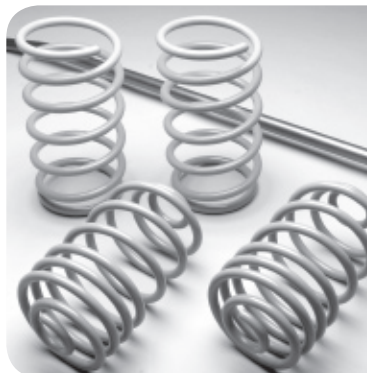
SPORT SPRING KITS